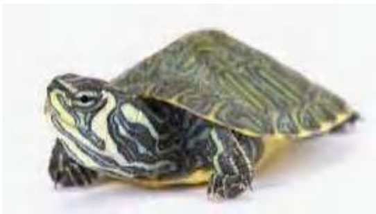
YELLOW BILLIED SLIDER

A PLASTIC heater is highly recommended because turtles are bigger animals than fish and they have hard shells that can break the glass tube of an ordinary aquarium heater. If that happens, your turtles will probably be electrocuted and die.