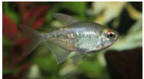
LARGE DIAMOND NEON