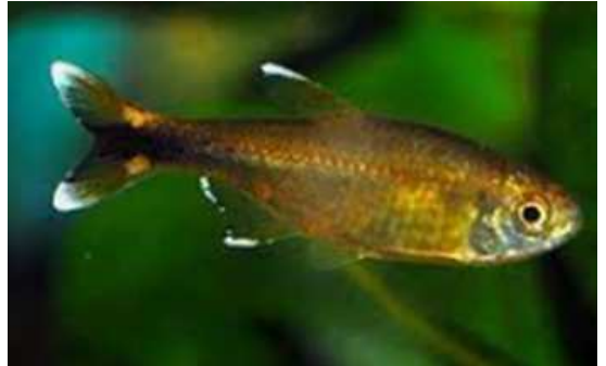
SILVER TIP TETRA