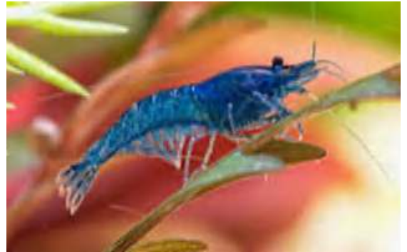
JAPONICA AMANO SHRIMP